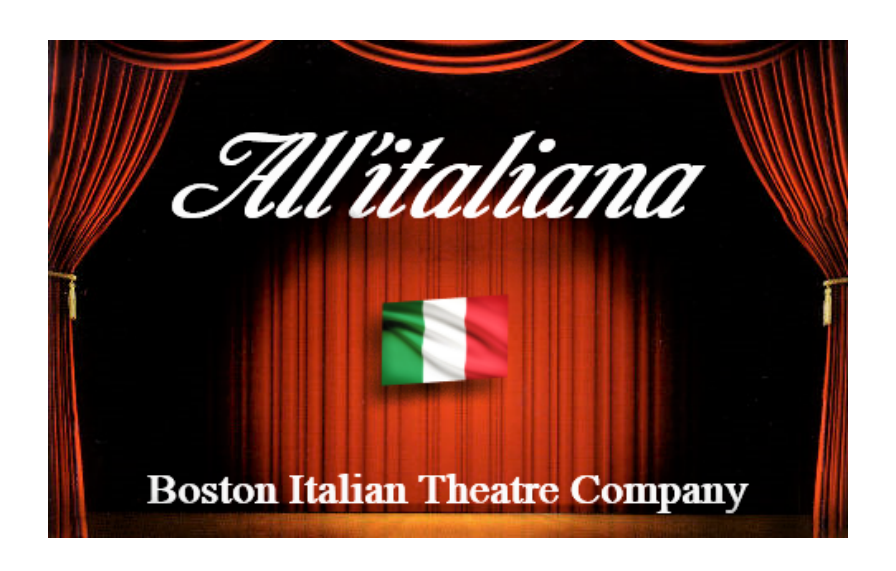
All'italiana - Boston Italian Theatre Company presents:

Io mi canto da sola - Storie di donne mai arrese I sing my own song - Stories of women who never surrendered.